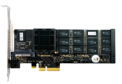
Fusion ioMemory<sup>™</sup> - ioDrive®</sup>